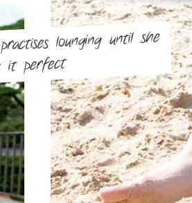
'PARTNERS LOVE COMING HERE TO RELAX. THEY LOVE THE ATMOSPHERE'