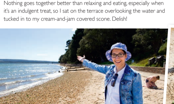
Sun, sea, sand - and scones. The perfect holiday combu

This sounded perfect to me, so my next stop was the beach. Ahh, the beach. Calm breeze, warm sand and shining sun = bliss. I lounged in a deck chair after having made a few sandcastles and, while I could've stayed there for hours, the clock struck 3pm... aka cream tea time! Nothing goes together better than relaxing and eating, especially when